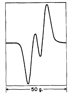
Figure 1. First derivative e.s.r. spectrum of the dianion radical III in dimethoxyethane.

incorporation of two atoms of deuterium, giving VII, as shown by n.m.r. and mass spectrometry. In contrast, treatment of the allylic ether IV with sodium for 3 days followed by quenching with D<sub>2</sub>O resulted in the production of 1,1,3,3-tetraphenylpropene- d_3 (80%); none of the propane VII could be detected in the total crude reaction product.<sup>4</sup>